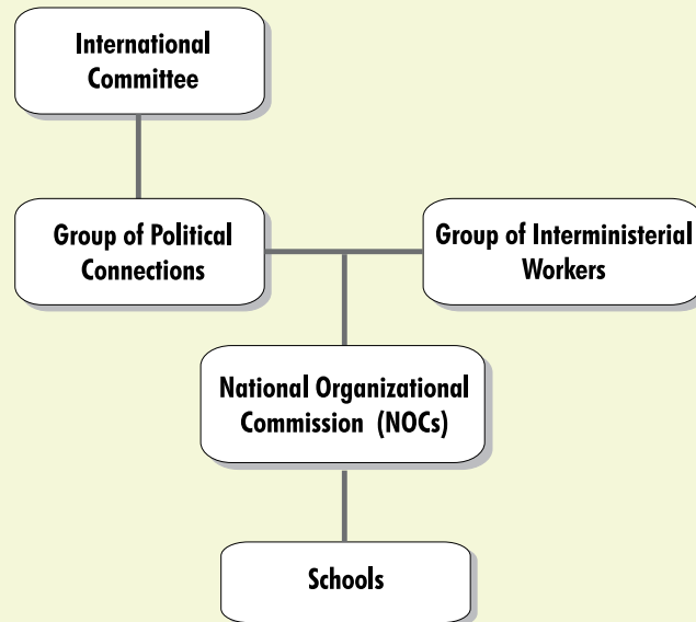
Figure 2: Diagram – Instances of decision and execution.

The Children and Youth International Conference is based on an organizational structure that aims toward an articulated, shared, and potentialized way to interact between national and international organizations. This structure (Figure 2) will be able to mobilize different partners in different places. It is formed by the following groups and committees: